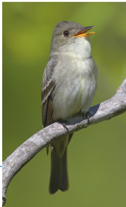
Eastern Wood-Pewee. Scioto County, Ohio; May 2004.

I look forward to sharing my excitement about these patterns with you.