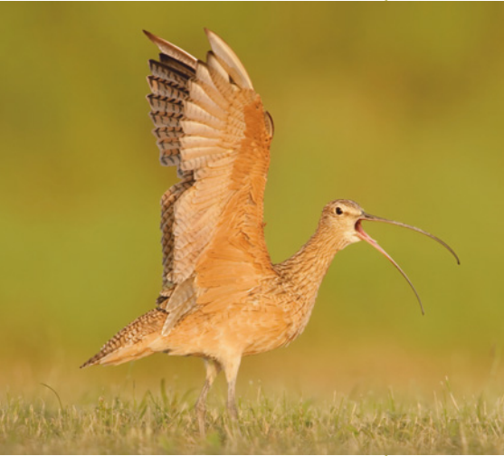
Long-billed Curlew. Chippewa County, Michigan; May 2006.

near the world-famous birding destination of Malheur National Wildlife Refuge.