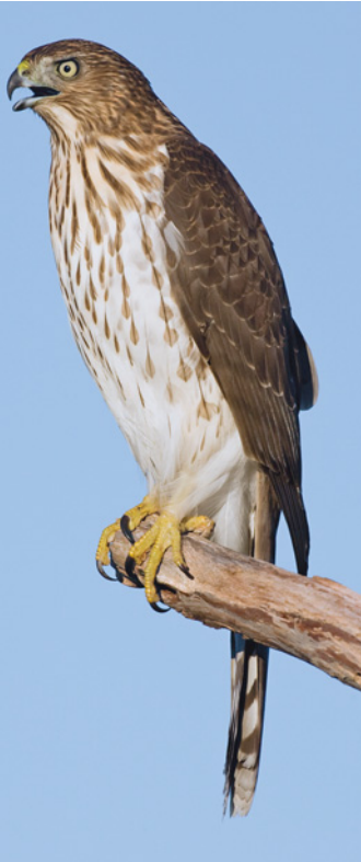
Cooper's Hawk. Cape May, New Jersey; October 2007.