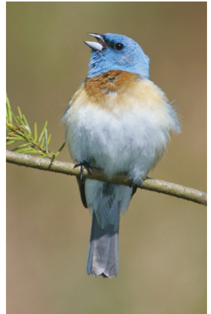
Lazuli Bunting. Lane County, Oregon; June 2008.