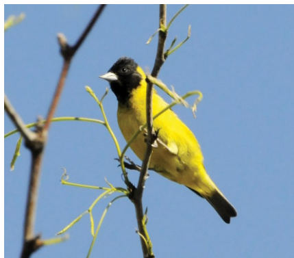
Black-headed Siskin, first record for ABA Area if accepted, South Padre Island, 1 Mar. '09.

West Coast and Northwest: At least 2 Bewick's Swans were in Modoc , CA 2/17–19. An adult Blue-footed Booby was seen on a pelagic trip off San Diego , CA on 3/5. CA hosted a number of rare gulls during the period. A Little Gull was in Riverside late Feb through early Mar. Birds showing traits of "Kumlien's" Iceland Gulls were reported in Santa Barbara , Del Norte , and Yolo . Lesser Black-backed Gulls abounded, with birds in Imperial , Riverside , Yolo , and Los Angeles . Multiple Slaty-backed Gulls were also present, with individuals in Monterey , San Mateo , Yolo , and Humboldt . Following the 3 from the previous reporting period, 2 Parakeet Auklets were seen offshore in Santa Barbara , CA on 3/1. CA's second record of "Mangrove" Yellow Warbler continued through the period in San Diego . Yellow-throated, Grace's, and Worm-eating Warblers continued at various locations across CA. As mentioned above, North America's first well-documented over-wintering Scarlet Tanager continued in San Diego , CA. A male Rose-breasted Grosbeak was photographed at a feeder in Stevens , WA in late Feb. Rusty Blackbirds continued in Del Norte and San Diego , CA. Alaska's fifth record of Cassin's Finch was photographed at feeders in Seward in late Feb.