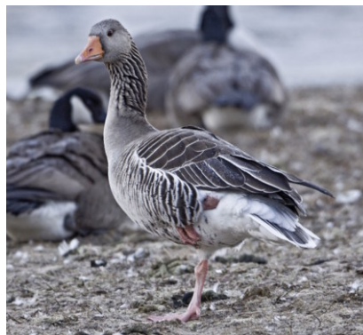
Graylag Goose, first U.S. record if accepted, New Haven County, CT, 25 Feb. '09.

Northeast: One of the period's top highlights, a wild-type Graylag Goose of the nominate subspecies was found on 2/23 in New Haven , CT and has been enjoyed and documented by many eager birders. This would represent the ABA Area's second record and a first for the U.S., if accepted. It is present at a well-known goose migration stop with Canada Geese banded in Greenland. More rare geese were in CT, in the form of 5 “Greenland” Greater White-fronted Geese in Windham .