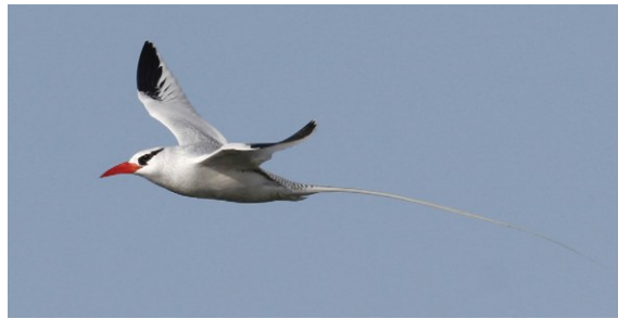
Adult Red-billed Tropicbird at seaside pond in Dare County, North Carolina, 10 March '09.

Mid-Atlantic: The Sussex , DE Black-bellied Whistling-Duck continued through 2/26. A “Black” Brant was in Mid-lex , NJ on 3/1. Barnacle Geese continued through late Feb in Hunterdon and Union , NJ. A drake Barrow's Golden-eye continued through 3/3 in Calvert , MD, as did 2 hens of that species in Monmouth , NJ. Monmouth , NJ also hosted a Pacific Loon for most of Feb. Barely annual in WV, 5 Red-necked Grebes were reported there during the period. Eared Grebes were in Monmouth and Hunterdon , NJ through early Mar. Representing the first well-documented state record, a Western Grebe