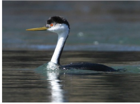
Western Grebe, 1st PA state record, Conodiguinet Creek, Cumberland County, PA, 17 Feb '09.

Interior West: A Tundra Swan was in Apache , AZ on 2/20, while 4 lingered in Cochise through at least 3/3. A Whooper Swan continued in Gooding , ID through at least 2/21. The "Common" Green-winged Teal was seen again in Maricopa , AZ on 2/22. A Red-throated Loon was reported on the Colorado River in AZ on 2/26. NV's third Lesser Black-backed Gull was in Clark in early Mar. The wintering Short-tailed Hawk continued through at least 3/2 in Pima , AZ. A Ruff was a good find in Maricopa , AZ 2/19. An adult Heermann's Gull visited Cochise , AZ on 2/22. The ABA Area's first Sinaloa Wren was growing slightly more vocal by the end of the period in Santa Cruz , AZ. Black-capped Gnatcatchers continued in various locations in AZ and NM.