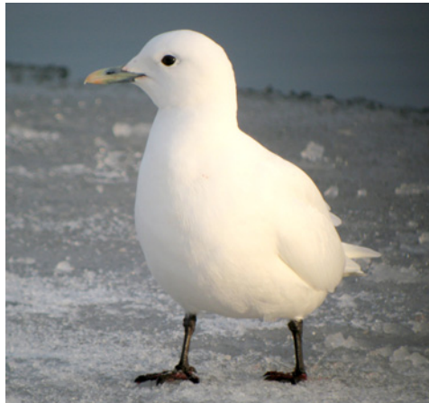
Adult Ivory Gull, North Rustico, Prince Edward Island, 31 Dec. '08.

Northeast: Yet another adult Slaty-backed Gull was discovered in NL, this one on 12/28. At least one Yellow-legged Gull (an adult) was still being seen in St. John’s, NL. Two Thayer’s Gulls, potentially CT’s 4th and 5th, were found at a landfill in Windsor, Hartford . A pristine adult Ivory Gull was first seen at North Rustico, PE 12/26. An adult Forster’s Tern was seen at Long Beach, NL 12/14. Two Dovekies were seen from shore 12/21 at Stratford, Fairfield , CT following a strong coastal storm; another was found alive at the inland town of Lebanon, New London , CT the same day. A Varied Thrush was present under a backyard feeder in Wilton, Fairfield , CT 12/9–10; three more were in ME. A Yellow-throated Warbler first appeared 12/6 in Greenwich, Fairfield , CT. Numbers of White-winged Crossbills continue in the region.