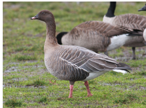
Pink-footed Goose, Kissena Park, Flushing, NY, 28 Dec. '08.

South-Central: Two Long-tailed Ducks were reported from TX: one at Hagerman NWR (along the OK border) and the other at Kaufer-Hubert Park, Kleberg . At least 6 Masked Ducks were discovered in Willacy , TX 12/14; they continue to be seen. A Purple Sandpiper was wintering on South Padre Is., Cameron , TX. AR’s 2nd Broad-billed Hummingbird reappeared at a different address in Conway, Faulkner . An adult male Fork-tailed Flycatcher was discovered 1/3 in Willacy , TX. A rare winter Varied Bunting was reported from Wharton , TX 1/4. Single Blue Buntings were present in Hidalgo , TX at both Bentsen-Rio Grande SP and the Frontera Audubon Thicket in Weslaco. A female Crimson-collared Grosbeak was discovered at the latter location 12/15. A male White-winged Crossbill was showing well at a Cleveland , OK feeder in early Jan.