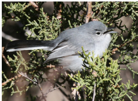
Basic male Black-capped Gnatcatcher, Guadalupe Canyon, NM, 29 Dec. '09.

Black Hills area) in early Jan. Two Varied Thrushes were present in northern IN: one, a male, was found at the same location in Porter as a Spotted Towhee; another, a female, has been frequenting a Marshall feeder since early Dec. A Northern Parula was in Toronto, ON 12/13. As elsewhere, Northern Shrikes, White-winged Crossbills, and Snowy Owls were being seen in good numbers south of their normal winter haunts. A report of 75–90 White-winged Crossbills in Lake , IL 1/11 was noteworthy.