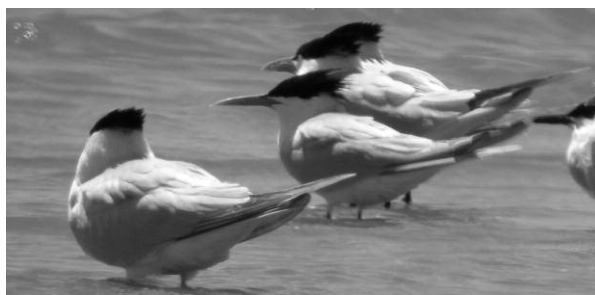
Unidentified orange-billed Thalasseus tern, (center) with congeners, Bolivar Flats, TX, 15 April '08.

NORTH-CENTRAL: A flock of 11 Black-bellied Whistling-Ducks was discovered on a farm pond in Clay , IL, 7 May. A Mottled Duck first found on 1 May near Point Pelee, ON, provided a first-ever record for the whole of Canada. A Tufted Duck was photographed near Selkirk, MB, on 23 Apr. A White-tailed Kite, Missouri’s first, enthralled St. Louis birders on 3 May. Another wind-blown kite, a Mississippi this time, was seen in Hennepin , MN, on 3 May. Black Rails were heard calling in Stoddard , MO, 3–6 May. Always big news inland, a Curlew Sandpiper in Holt provided MO with its 2nd record, 26–27 Apr. A Mew Gull provided Missouri with a possible first state record on 18 Apr in Clay , and another was observed off-and-on through 6 Apr near Pierre, SD. A Burrowing Owl was observed on Pelee Is., ON, 25–26 Apr. A pair of Barred