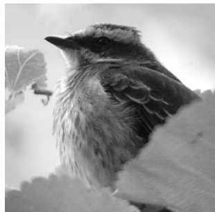
Piratic Flycatcher, Pollywog Pond, Corpus Christi, Texas, 4 May '08.

SOUTH-CENTRAL: Masked Ducks continue to be seen on the King Ranch in TX. A dark-morph Short-tailed Hawk surprised birders in Coryell , TX, on 12 Apr. The Gulf’s now-famous roving Greater Flamingo pair (one a wild American bird from Mexico, the other a zoo escapee of the Old World subspecies) put in an appearance at Bolivar Flats, Galveston , TX, 12 Apr. A Reeve was discovered at Hornsby Bend, Travis , TX, 12 Apr. A nearly impossible-to-identify Thalasseus tern at Bolivar Flats, Galveston , TX, 15 Apr was either TX’s fourth Elegant Tern, TX’s first “Cayenne Tern”, or North America’s first Lesser Crested Tern. TX’s 4 th Piratic Flycatcher spent the weekend in Nueces 3–5 May. A Lucifer Hummingbird on 27 Apr in Hidalgo , TX, was well out-of-range. Cameron , LA, has been a hotbed of rare bird activity; highlights include a Ferruginous Hawk on 26 Apr, at least 2 Black Rails on 27 Apr, a Black-whiskered Vireo on 27 Apr, the state’s first well-documented Chihuahuan Raven on 12 Apr, and a Red-footed Booby (LA’s second ever and first in 68 years) on 26 Apr. Also in LA, Gray Kingbirds were noted in Grande Isle, Jefferson and