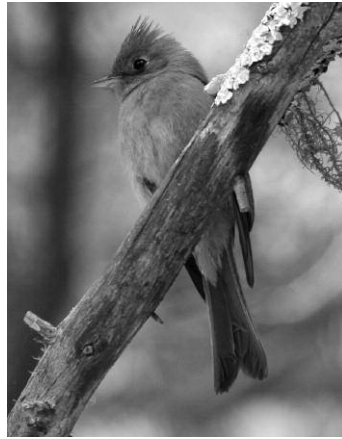
Tufted Flycatcher, Cave Creek Canyon, Arizona.

SOUTHWEST: A Brant was observed at Willcox, Cochise , AZ, 29 Apr. A cooperative Hudsonian Godwit was photographed in Weld , CO, over its early 16–17 Apr stay. A male Ruff provided Colorado with a 3 rd state record in Boulder on 1 May. The 4 th U.S. record of Tufted Flycatcher was discovered near Portal in Cochise , AZ, on 5 May and was still being seen as we went to press. The long-staying Rufous-backed Robin in Sierra , NM, was last noted 12 Apr. Lea , NM, hosted a Long-billed Thrasher 25 Apr. On 22 Apr a Lucy's Warbler was observed in