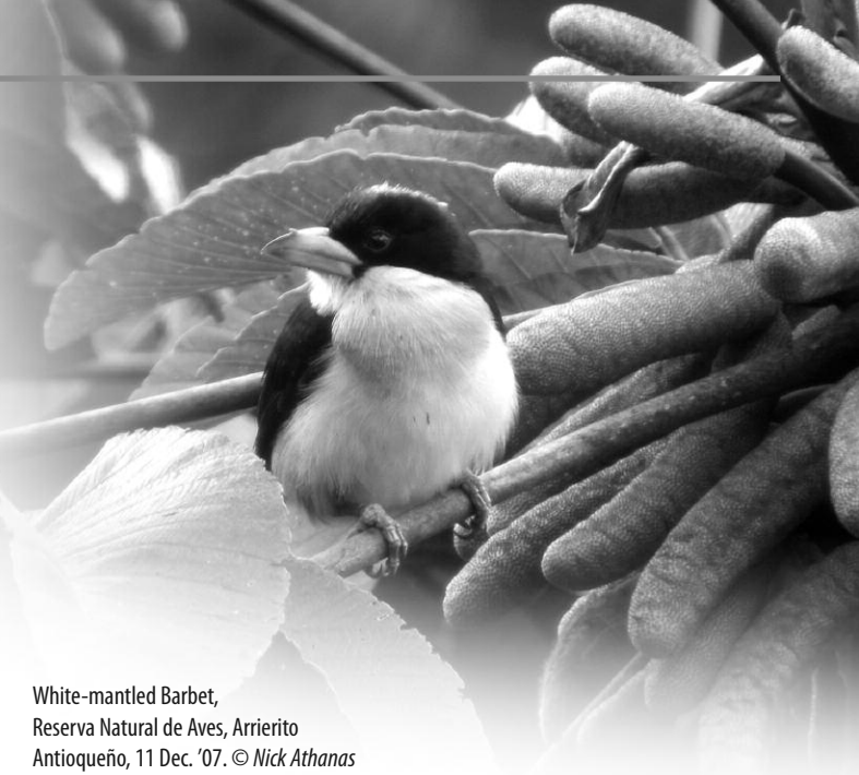
White-mantled Barbet, Reserva Natural de Aves, Arriero Antioqueño, 11 Dec. '07.

The Yellow-eared Parrot Reserve was the last stop on our Colombian circuit. We stayed in the wonderful colonial town of Jardin and took Jeep taxis up a very rough road to the reserve. We settled down on a hilltop in the first light of dawn hoping the endangered endemic, Yellow-eared Parrots would appear. Fog slipped in-and-out, but no parrots. We ate a breakfast of empanadas, fruit, and coffee, and then began to bird our way down the hill. Soon the fog rolled in making it very difficult to see. We saw one fly-by with two parrots, but they were too high, appearing only as shapes. We birded slowly down the road. While enjoying our first good sighting of a Black-billed Mountain-Toucan, the fog lifted somewhat. Two more parrots flew over, low enough to see yellow on their heads. We finally had an acceptable sighting. Then the fog returned.