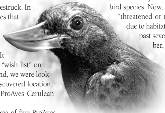
Recurve-billed Bushbird, Bushbird Reserve, Ocaña, Norte de Santander, Colombia.

Bushbirds were once quite common in Colombia, as were many other endemic or near-endemic bird species. Now, many of them are classed as “threatened or near-threatened”, primarily due to habitat loss. Land-clearing over the past several hundred years—for timber, farming, mining and now