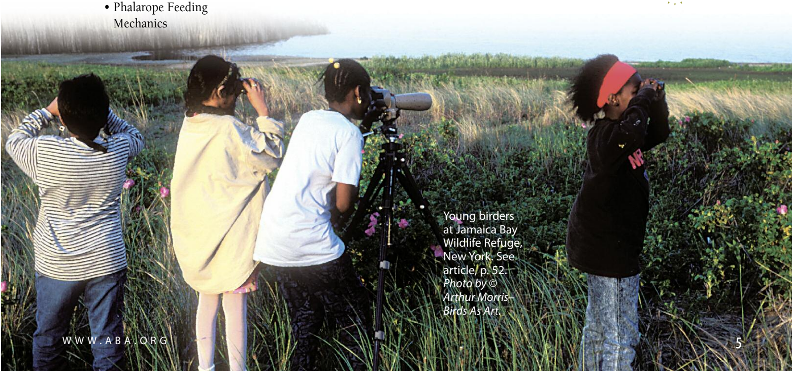
Young birders at Jamaica Bay Wildlife Refuge, New York. See article, p. 52.