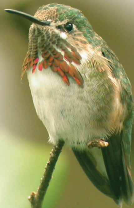
Four-year-old male Calliope Hummingbird . See article, p. 32.