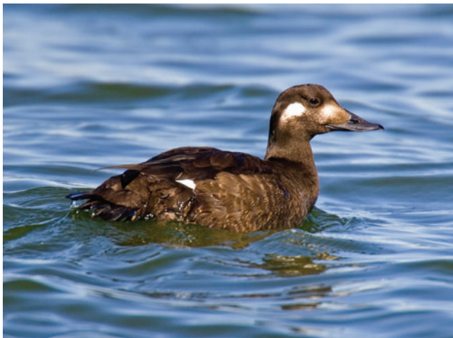
Recent taxonomic splits adopted for the British list involve three waterfowl: Canada Goose, Black Scoter, and White-winged Scoter. The British Ornithologists' Union has separated each into two species, while dividing Herring Gull into three. Travis County, Texas; November 2005.

As did the American Ornithologists' Union in 2004, the BOU divides Canada Goose into a large-bodied and a small-bodied species: Greater Canada Goose ( Branta canadensis ) and Lesser Canada Goose ( B. hutchinsii ), which correspond