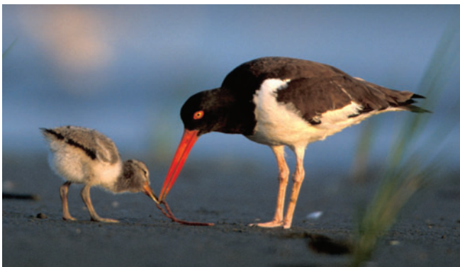
Sandy beaches were once thought to be the only nesting habitat of the American Oystercatcher , but increasing numbers of oystercatchers are breeding in coastal marshes. In a recent survey in Virginia, 38% of all breeding pairs were found in marshy lagoons between barrier islands and the Delmarva Peninsula. Cape May, New Jersey .

Since then, building development and disturbance by humans have severely threatened or destroyed the traditional nesting habitat on surfside sands along much of the Atlantic coast. Fortunately, many oystercatchers have adapted their breeding behavior to avoid the dangers. They nest in salt marshes, where they are largely free from development and disturbance, and are safer from predators as well. From the 1960s to the 1990s, more and more pairs