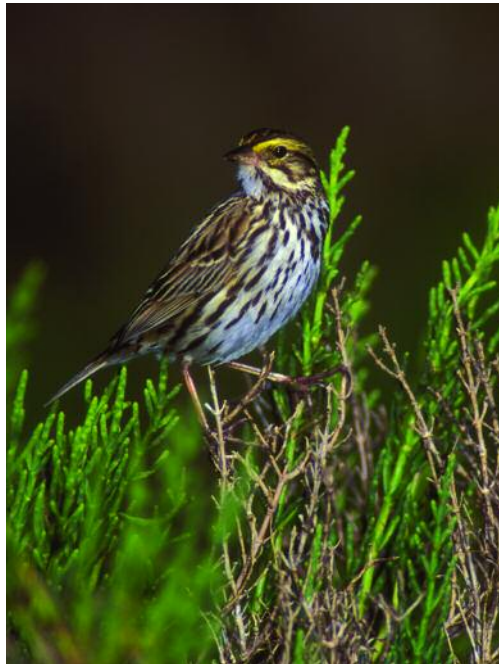
Variation within the Savannah Sparrow is well known, but where do the major divisions fall? A recent study shows that the wetland races (including the distinctive Belding's Savannah Sparrow, shown here) of southern California and northwestern Mexico constitute a distinct group, separate from all other Savannah Sparrow populations. Bolsa Chica Ecological Preserve, California; December 1999.