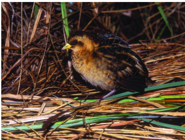
Despite its extensive breeding range, the Yellow Rail is surprisingly scarce. For example, the U.S. breeding population is estimated at only 600–750 pairs. The highest concentrations appear to be in the Hudson/James Bay region of Canada, where several thousand pairs breed. Aitkin County, Minnesota; June 2002.

The Yellow Rail has always held a high place in birders’ hearts. In 1970, it ranked fourth on American Birding Association members’ “most wanted birds” ( Birding 2:13).