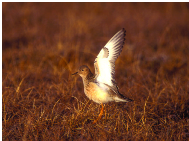
Ranked as “highly imperiled” in a 2004 update of the U.S. Shorebird Conservation Plan, the Buff-breasted Sandpiper is declining sharply and faces serious threats on the wintering grounds. The U.S. Plan, along with a companion Canadian Plan, provides a detailed “conservation assessment” for each shorebird species that breeds in North America. North Slope, Alaska; June 1995.

It is June at Polar Bear Cove on Bathurst Island, where male Buff-breasted Sandpipers flutter-jump, tiptoe, and wing-stretch in courtship dances on their tundra leks. It is Labor Day at a sod farm in New Jersey, where birders scan the grass for juveniles on their way to South America. It is May on the tilled fields of Nebraska, where flocks stop to rest and feed before hurrying on toward the high-Arctic summer. The future of that wondrous cycle has become an increasingly urgent concern. Buff-breasted Sandpiper is one of three taxa newly ranked as “highly imperiled” in a 2004 update of the United States Shorebird Conservation Plan. The other two are the endemic Hawaiian subspecies ( knud-