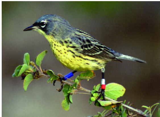
Kirtland’s Warbler has long been considered fiendishly difficult to find on its wintering grounds in the Bahamas. But a recent mistnetting-and-banding study, funded in part by the U.S. Forest Service and conducted by a research team that includes Bahamian students, has been highly successful. Since 2002, the team has banded 50 Kirtland’s Warblers on the island of Eleuthera alone. Eleuthera Island, Bahamas; April 2004.