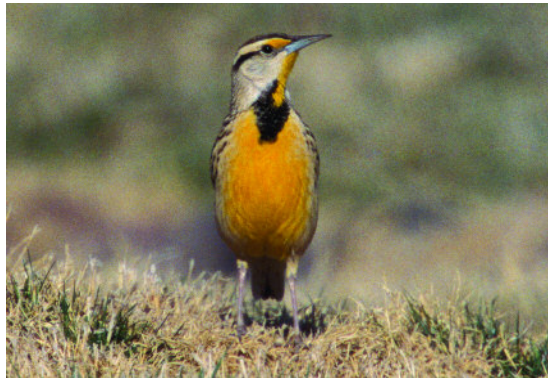
Gloger's Rule posits that populations of birds (and other organisms) tend to be darker in humid environments and paler in arid climes. For example, the lilianae subspecies of Eastern Meadowlark in the Desert Southwest is notably paler than populations of this species in less-arid climates. What is the mechanistic basis of the pattern known as Gloger's Rule? A recent study indicates that feather-degrading bacteria, which are more abundant in humid environments, are thwarted by darker, more-melanized pigments. Sierra Vista, Arizona; February 2003.

52 North American species and concluded in 1986 that 50 of those species supported the rule ( Current Ornithology 4:1–69). Among familiar examples are darkly-colored subspecies of the humid Pacific Northwest such as the "Black" Merlin ( suckleyi ) and the "Sooty" Fox Sparrow group ( unalaschcensis and closely related races). Well-known pale races of the dry Southwest include "Desert" ( saltonis ) Song Sparrow and "Lilian's" ( lilianae ) Eastern Meadowlark. The tendency does not refer only to those populations classified as subspecies; for example, unnamed House Sparrow pop-