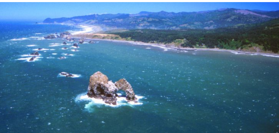
Mack Reef, an assemblage of 25 sea rocks right off the Oregon coast, is home to 43% of the state’s breeding Leach’s Storm-Petrels. Mack Reef (Oregon Islands NWR Complex) Important Bird Area, Oregon; 19 June 1998.

The Important Bird Areas program is a global effort, with the difference between global and state level IBAs being a matter of relative scale. Global IBAs are significant to species of global conservation concern, taking into consideration worldwide populations of a species or a group of species. State-level IBAs have a narrower focus, taking into consideration a site’s significance to statewide or regional populations. The criteria used for different IBA programs reflect the relative size of the effort. For example, a location that shelters a large percentage of Oregon’s Yellow Rail population may not meet global IBA criteria, but when considered at a statewide level, it becomes much more significant. Global IBA criteria may require an annual concentration of, say, 12,000 Redheads (1% of the total population), whereas some state-level thresholds are set lower, for