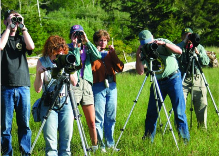
A hallmark of the Important Bird Areas program in Oregon (and in other states) is broad involvement from both recreational birders and professional ornithologists. Bandon Marsh National Wildlife Refuge Important Bird Area, Oregon; 30 April 2004.

ing south toward the California border, we encounter Miller Island along the Klamath River. Like nearly all of the wetlands in this part of the Klamath Basin, Miller Island is a critical staging area for waterfowl. It is here that the largest flocks of Ross's Geese in Oregon often stop to rest and refuel on their spring journey north; 80% of the world's population of Ross's Geese visit the Klamath Basin. Collectively, the basin wetlands are used by 80% of the all the ducks, geese, and swans in the Pacific waterfowl flyway.