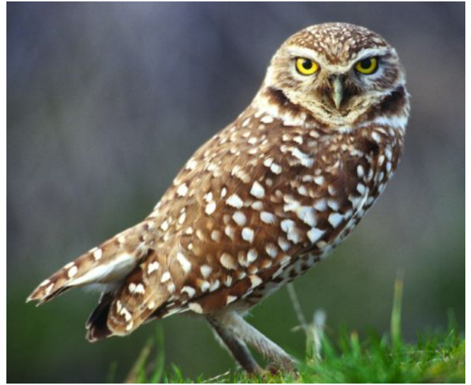
Although still widespread and fairly numerous in western North America, the Burrowing Owl is disappearing from some regions. By preserving Important Bird Areas in Oregon and elsewhere, population declines may be halted or reversed. Lane County, Oregon; January 1999.

Important Bird Areas were first identified in the 1980s, when BirdLife International initiated the program in Europe. In Europe, more than 3,000 sites—totaling 7% of the land area—have been identified. IBAs have proven to be an effective tool for bird conservation, as they directly benefit birds by setting science-based priorities for habitat conservation and by promoting positive action to safeguard habitats. In the mid-1990s, the American Bird Conservancy launched an effort to identify globally important sites in the United States, and the National Audubon Society