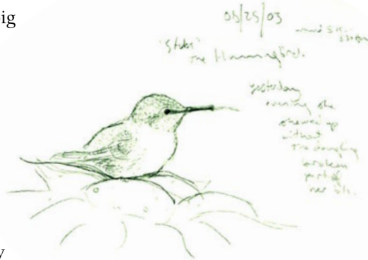
Field sketch by

Despite her injuries, Stubs was not subdued. She sat on the front-porch-swing rope again and defended the porch and feeder from all passing hummers. I watched and sketched her for around an hour or so. She was a sad sight with her mangled