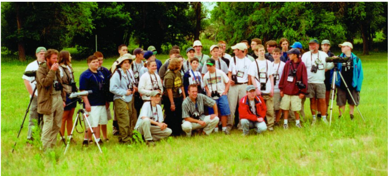
The Young Birders' Conference is a great forum for fun, friendship, learning—and, of course, lots of birding. Fort Collins, Colorado; June 2000.