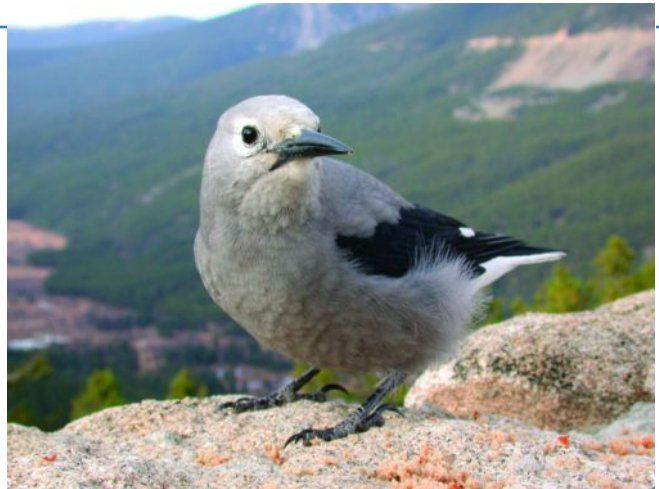
Participants in the 2000 Young Birders' Conference got to visit Rocky Mountain National Park, where everybody got great looks at the confiding and inquisitive Clark's Nutcracker. Rocky Mountain National Park, Colorado; 7 October 2001.