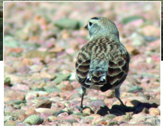
RIGHT: The Young Birders’ Conference provides workshops on topics such as the identification of sparrows—such as this McCown’s Longspur, in a frustrating, but typical, pose. Pawnee National Grassland, Colorado; 29 April 2003.

many of the conference participants had never met in person. The YBC provided an opportunity for these young people to come together, to learn from and interact with their expert leaders, and to enjoy the company of other young birders.