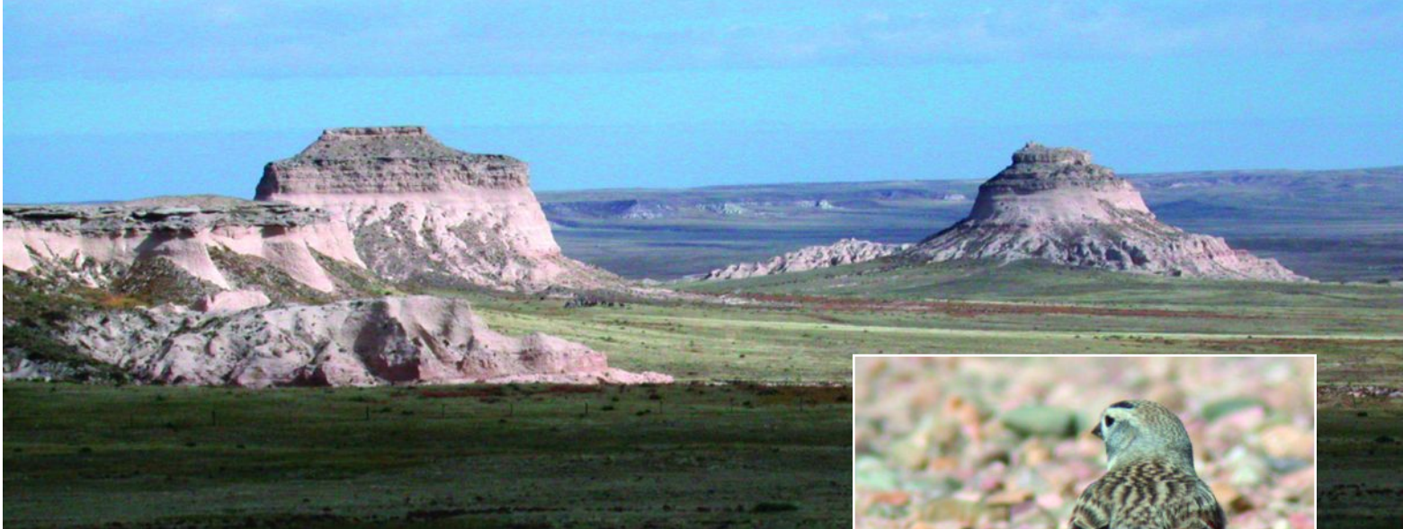
ABOVE: The beautiful Pawnee National Grasslands—home to Ferruginous Hawks and Burrowing Owls, to Mountain Plovers and McCown’s Longspurs—was one of the field trip destinations at the inaugural Young Birders’ Conference in Fort Collins in 2000.